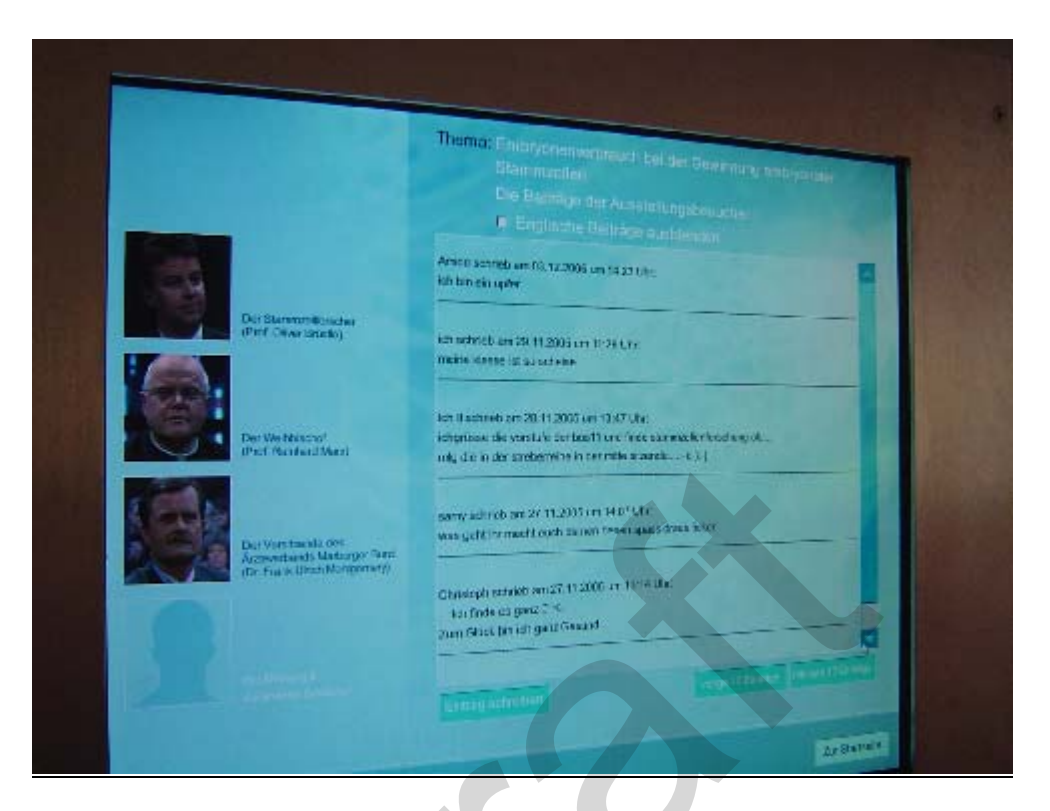
Figure 2: The current discussion tool at "Deutsches Museum", Munich

Furthermore, theories of attitude formation and change could be relevant as explanation of the relation between attitudes towards and knowledge about an object. E.g. a relation of attitude importance and accumulation of attitude-relevant knowledge by selective exposure to and elaboration on relevant information was found (Holbrook, Berent, Krosnick, Visser, & Boninger, 2005). Other empirical findings about the persuasive impact of group opinions on individual need for cognition also are of relevance (Areni, Ferrel, & Wilcox, 2000). Therefore, object of research will be attitude formation and attitude change and how these are linked to the exploration of an exhibit and knowledge acquisition. Theories like the Elaboration Likelihood Model could throw light on the individual cognitive processes that took place (Petty, & Cacioppo, 1986): Richard E. Petty and John T. Cacioppo (1986) created the Elaboration Likelihood Model of Persuasion to explain, in detail, how a persuasive message worked to change the attitude of the receiver. They proposed that a message was transmitted and received through one of two routes of persuasion: the central route (extensively elaborating on a message) and the peripheral route (focusing on issues or themes that are not directly related to the subject matter).