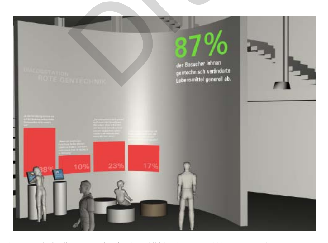
Figure 3: proposal of a dialogue station for the exhibition in autumn 2007 at "Deutsches Museum", Munich

A third study is planned for autumn 2007 and will be conducted in the context of a planned exhibition of "Deutsches Museum" in Munich where dialogue and discussion tools will be installed (see figure 3).. In this study, especially the question of external validity can be addressed in a real, natural setting, and I hope to be able to contribute to the design of dialogue and discussion tools through my main study described above